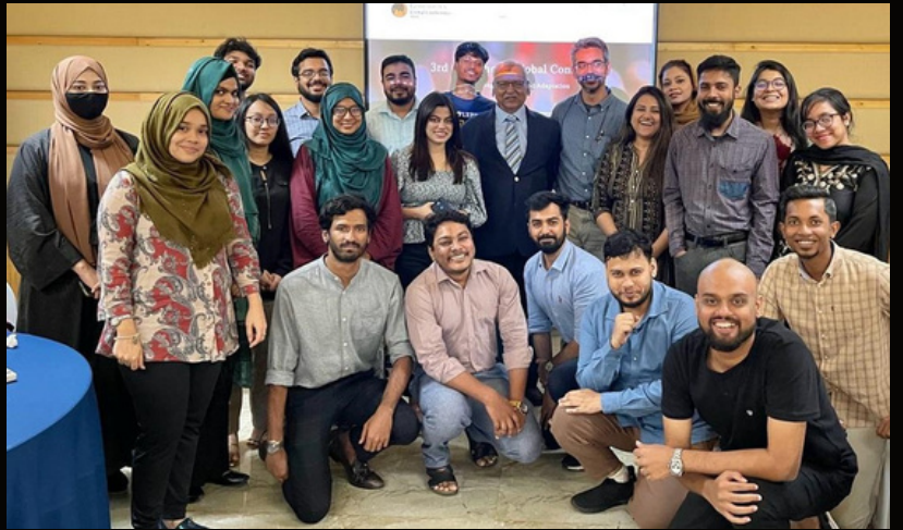
Group picture of GGC3 team