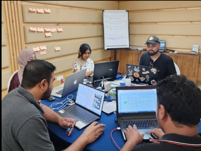
GGC3 IT team working together