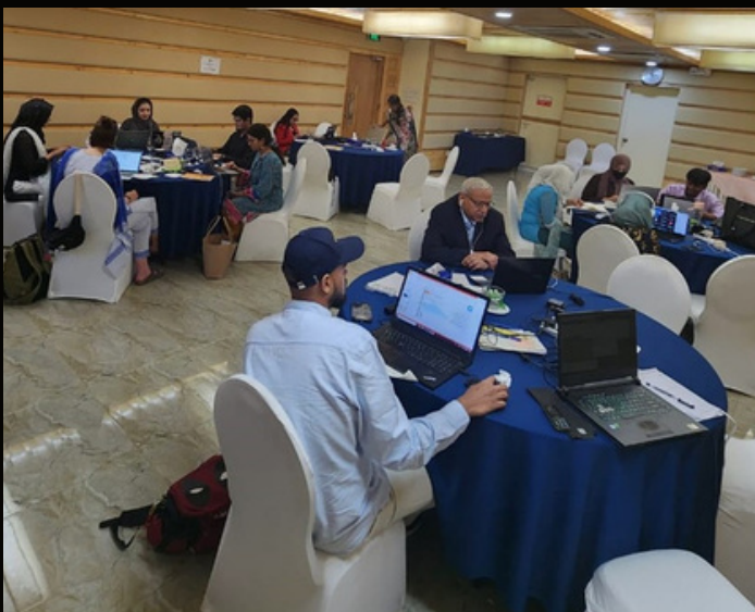
Gobeshona team working from the 24hr work station