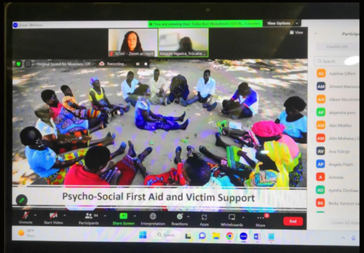
Panelists in one of the zoom sessions