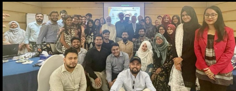
Closing ceremony picture with GGC3 team